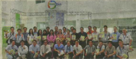
Vietnamese architects visited the GEO Building.

"The Malaysian government encourages green