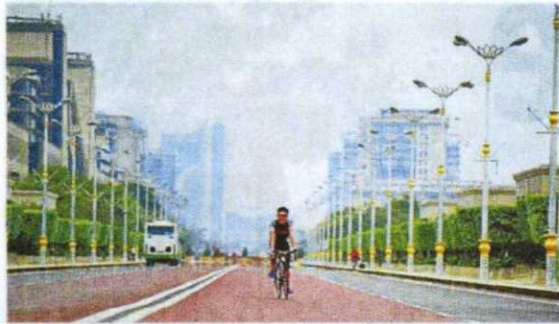
Blurry structure: The Prime Minister's office in Putrajaya as seen at 11.45am yesterday.