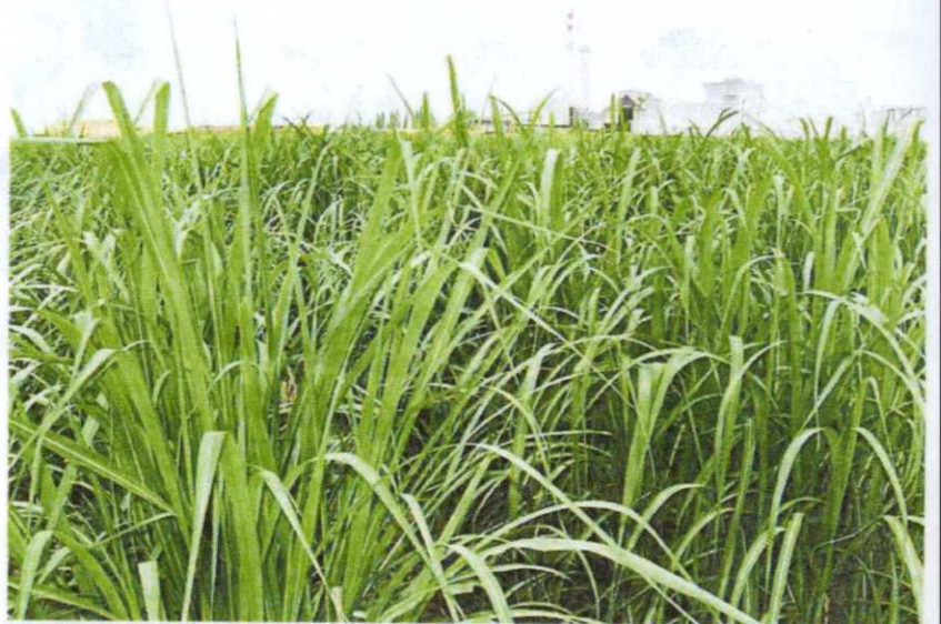
Sweet bounty: A sugar cane plantation fronting a factory producing sugar at Chuping which is earmarked to become Perlis' new economic growth centre.

Chuping is also expected to become the country's main poultry supplier with a large-scale breeding project — a joint effort between the