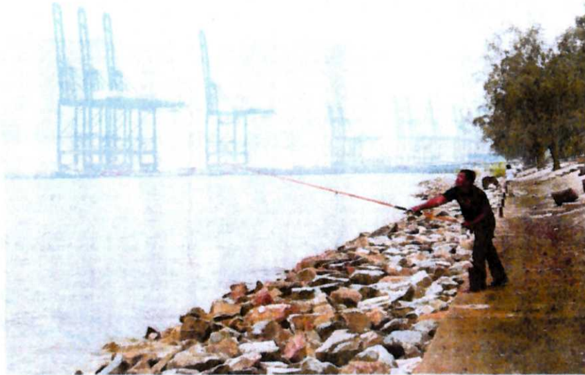
Fish can't wait: A man ignoring the haze in Port Klang as he tries his luck at fishing around 2.30pm yesterday.

Open burning at plantations and forest areas is common in Indonesia as it was the fastest and easiest