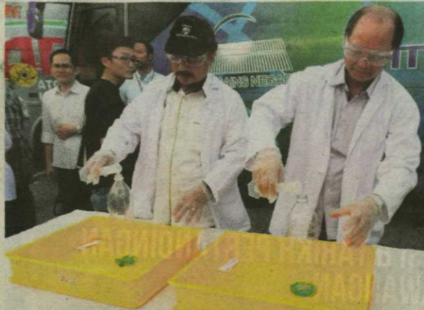
Madius (kanan) yang juga Menteri Sains, Teknologi dan Inovasi menunjukkan satu eksperimen sains dalam satu program, semalam.

KUALA KANGSAR – Sifat setia kepada parti yang ada dalam diri masyarakat Orang Asli akan membantu kemenangan BN pada PRK Kuala Kangsar kali ini, meskipun hanya tergolong dalam kumpulan minoriti.