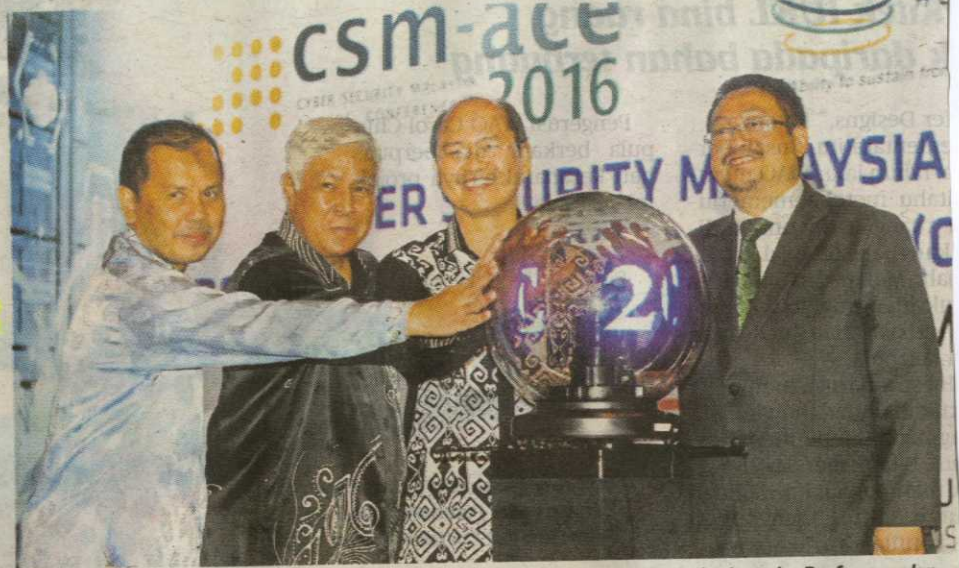
MADIUS (dua dari kanan) merasmikan majlis perasmian 'Cyber Security Malaysia-Awards, Conference dan Exhibition 2016', semalam.

"Disebabkan itu kita mengadakan Anugerah, Persidangan dan Pameran Cyber Security Malaysia (CSM-ACE 2016) untuk memberi pengetahuan mengenai daya tahan siber untuk sektor awam dan swasta," katanya dalam sidang media pra pelancaran CSM-ACE 2016, semalam.