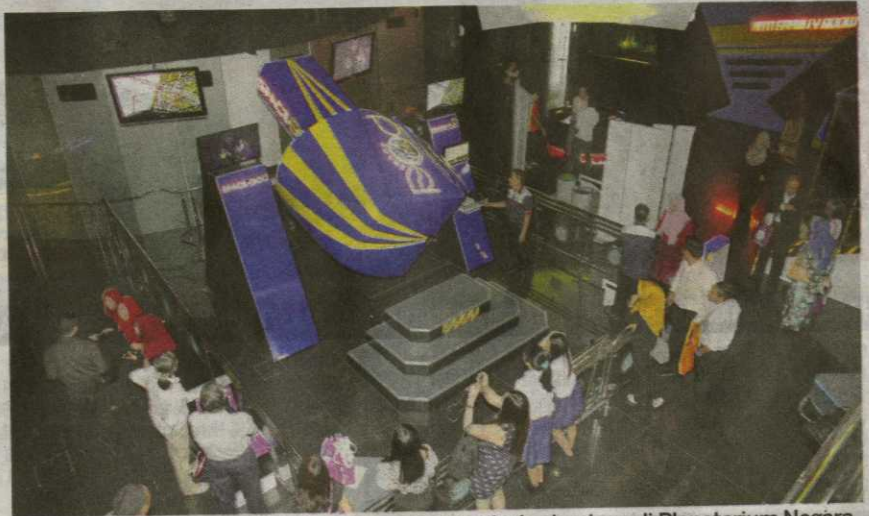
PARA pengunjung sedang melihat Space Pod ketika berkunjung di Planetarium Negara semalam.

Katanya, pembaharuan yang bernilai RM5.75 juta itu adalah medium kementerian untuk menggalakkan lebih ramai pelajar meminati Sains, Teknologi dan Inovasi (STI) dan menyokong inisiatif Sains, Teknologi, Kejuruteraan dan Matematik (STEM) Kebangsaan.