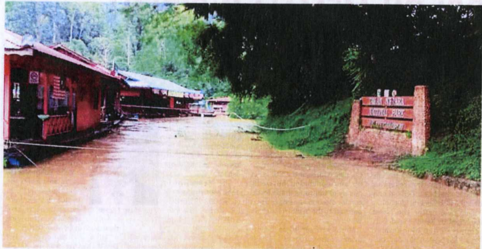
A flooded area in Taman Negara, Kuala Tahan, yesterday.

lages were cut off after the access road was flooded about 11am on Monday following continuous rain since Sunday.