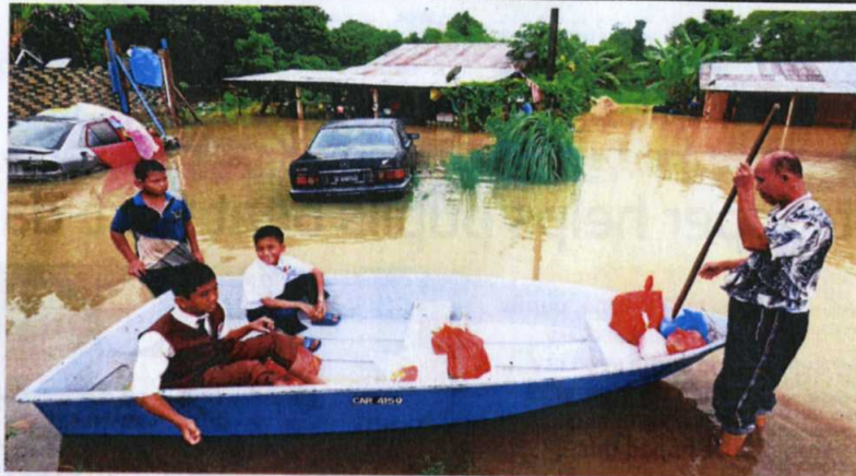
New transport mode: A resident of Kampung Sri Damai using his sampan to transport food supplies and pupils from school. The road leading to the village and surrounding area is covered by floodwaters.