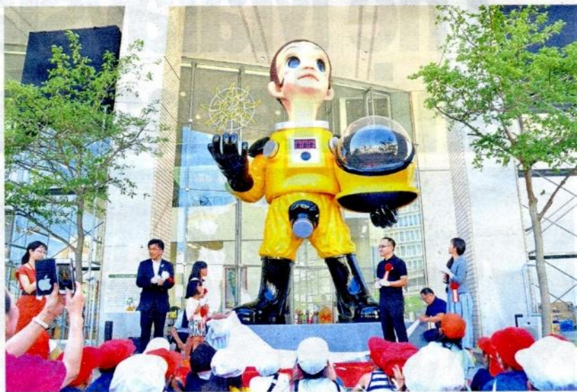
Sparking controversy: The 'Sun Child' statue being unveiled earlier this month at ceremony in Fukushima. — AFP

The meltdown affected a vast agricultural region, forcing many local residents to give up their ancestral properties – possibly never to return due to severe radioactive contamination. — AFP