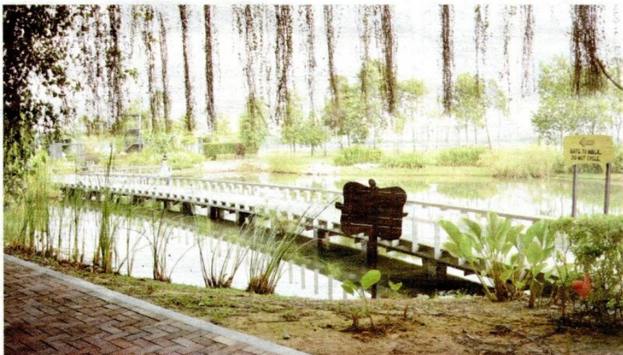
Scenic spots at Bandar Rimbayu designed to evoke nostalgia for nature.

To establish a direct line of communication, Azizan suggested