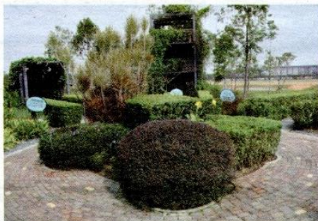
Bandar Rimbayu is committed to the green way of life.