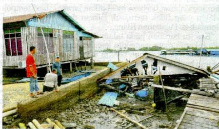
BEBERAPA penduduk melihat pelantar nelayan roboh selepas kejadian ribut di Kampung Nelayan Kuala Kurau, Parit Buntar semalam.

"Ibu saya yang sedang tidur ketika itu dikejutkan dengan bunyi deruan angin sebelum ia menerbangkan bumbung