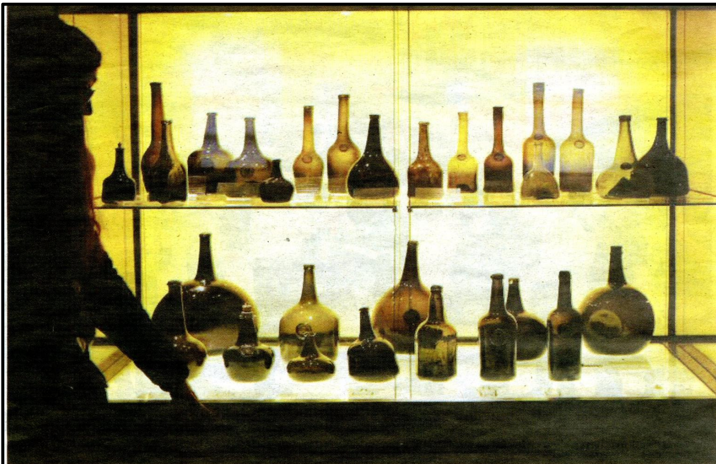
Old glass bottles of wine are displayed in the museum at the Royal Crystal Factory in La Granja de San Ildefonso, near Madrid.