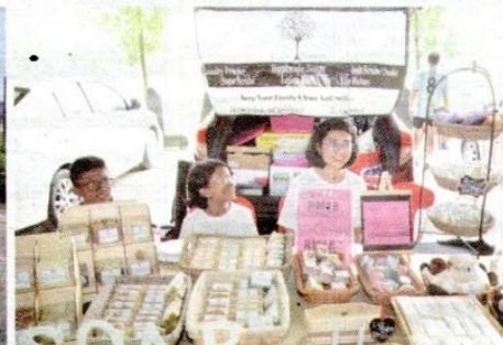
The Community Recycle for Charity outing features a number of young people.