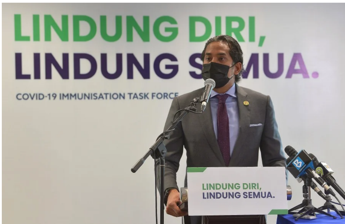
Science, Technology and Innovation Minister (Mosti) Khairy Jamaluddin.

"I have also received a letter by the United Nations (UN) that has offered cooperation in this matter, which would be presented to the Cabinet for a policy decision."