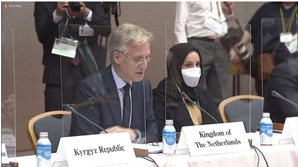
Others online and in person participating ministers