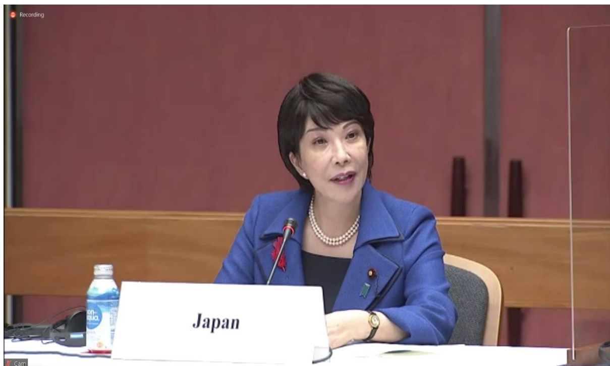
The Chair of the Ministers' Roundtable: H.E. Takaichi Sanae, Minister of State for Science and Technology Policy of Japan